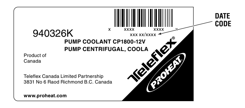
Figure C. Label Date Code Location.